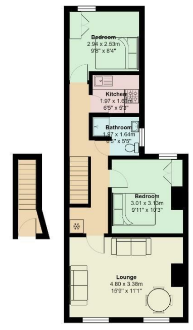
Diana Street, Roath

Total Area: 53.0 m 2 ... 570 ft 2 All measurements are approximate and for display purposes only